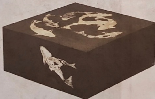
Zelouf + Bell Koi Noir low table is made of bog oak

As it happens, the couple have a combined background in arts and engineering. Two decades on, Zelouf + Bell are Ireland’s leading design partnership, their award-winning, handcrafted furnishings gracing homes in Paris, New York and Tokyo, Irish embassies around the globe and the National Mu-